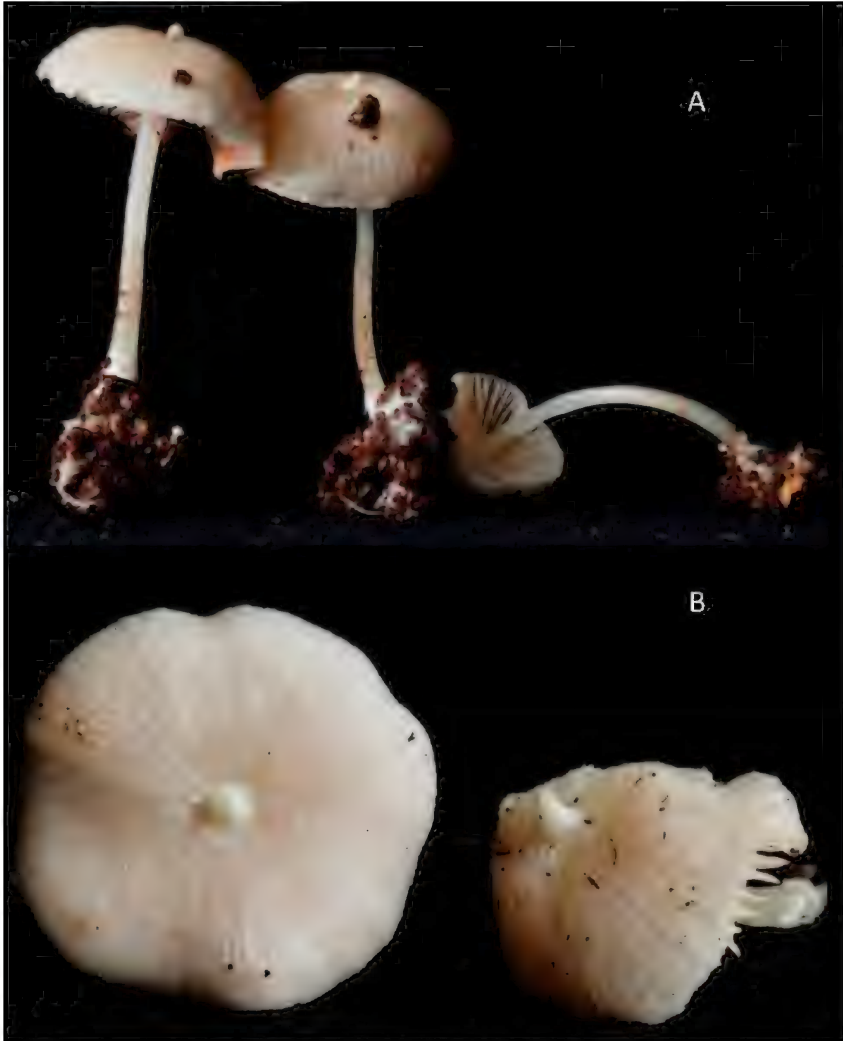
PLATE 3. Alboleptonia stylophora .

A: Basidiomata stature (DLL 9826); B: Pileal surface (DLL 9764).